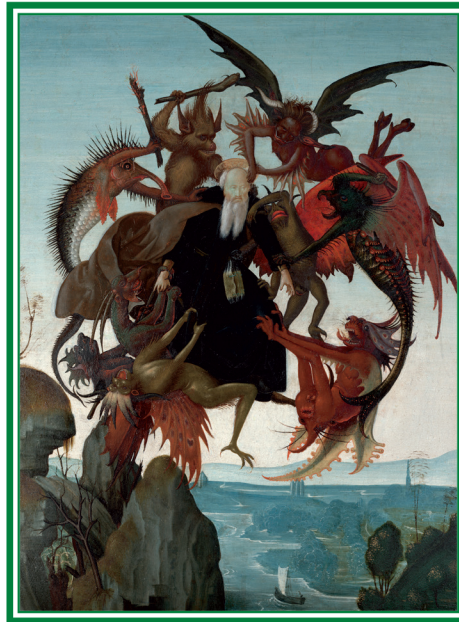
Michelangelo Buonarroti, Italian, 1475–1564 The Torment of Saint Anthony c. 1487–88, tempera and oil on panel

Michelangelo went to the fish market to study real scales so he could paint this.