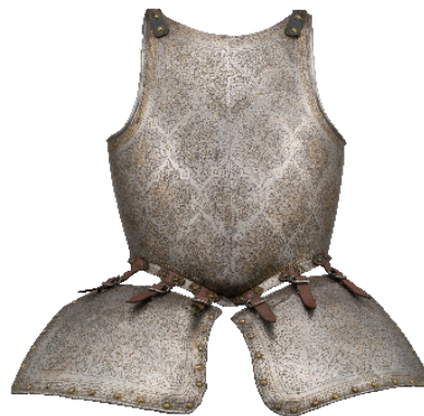
Breastplate and two tassets